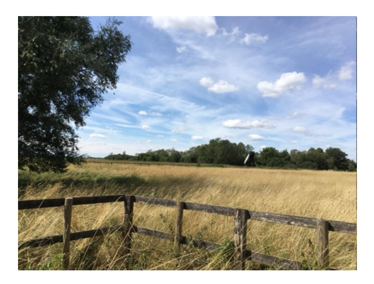
Countryside photographs on this, and previous page \ensuremath{\mathbb{C}} Lizzie Bannister